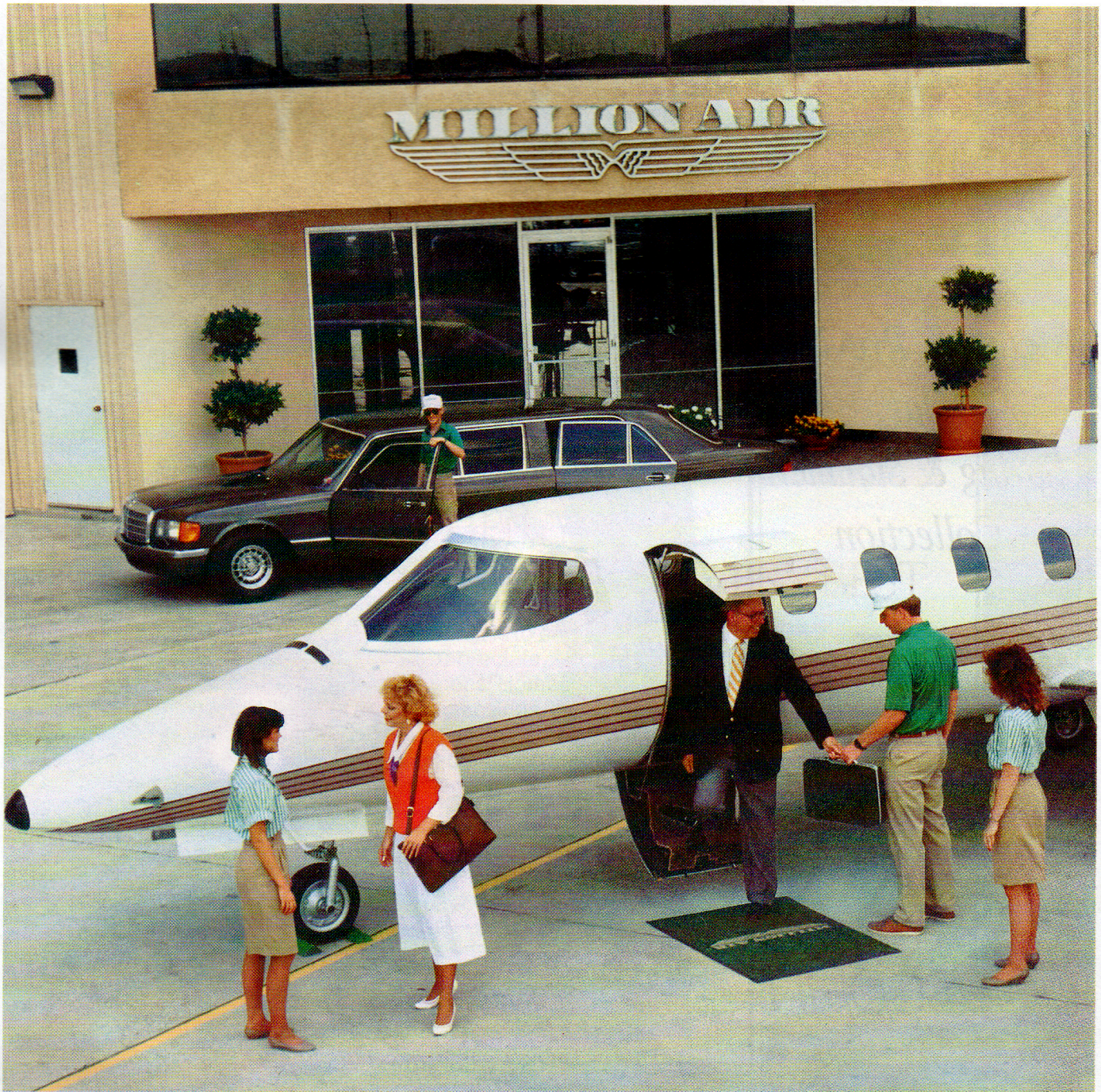
Business travellers enjoy the pampering they receive from Million Air.