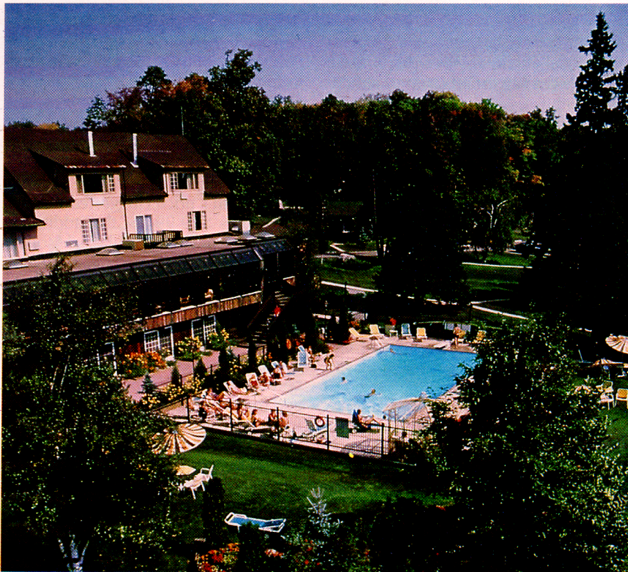
Deerhurst Inn and Country Club enjoys a country setting, above, which also offers the most modern condominiums, below.